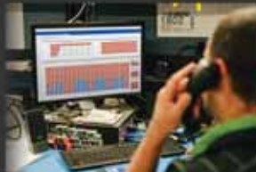
TRG's suite of Mobile Managed Services is the first full lifecycle mobility solution to maximize ROI and reduce asset downtime.