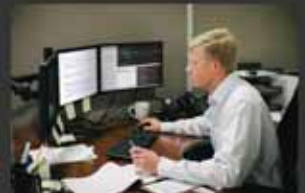
Our developers can create software solutions to fit your needs, including point-of-delivery systems, asset cataloging, loss prevention and more.

1.877.852.8740 www.trgrepair.com 31390 Viking Parkway, Westlake, OH 44145