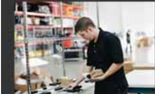
TRG buys, sells and repairs barcode scanners, mobile computers, mobile printers, POS terminals and more.